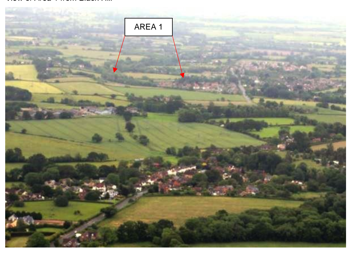
2.4.12 The Area is also visible from British Camp (c. 3.5km to the west), the summit of which is the location of 'Exceptional' AONB viewpoint no. 49. However, although clearly visible, from this angle of view it does not appear to extend so far into open countryside, given the visual context of the existing housing estate west of the Area.