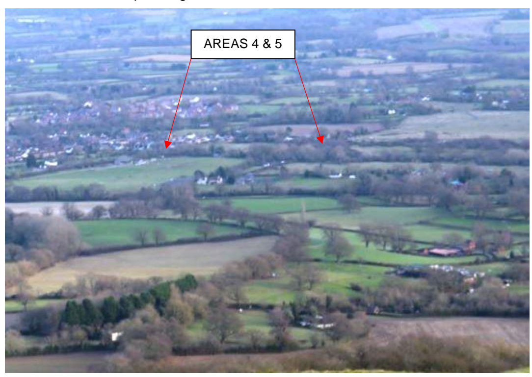
View from British Camp looking east

Area also visible from Hills' ridges and summits to north west: villagescape also 'intervenes' somewhat in views from these locations.