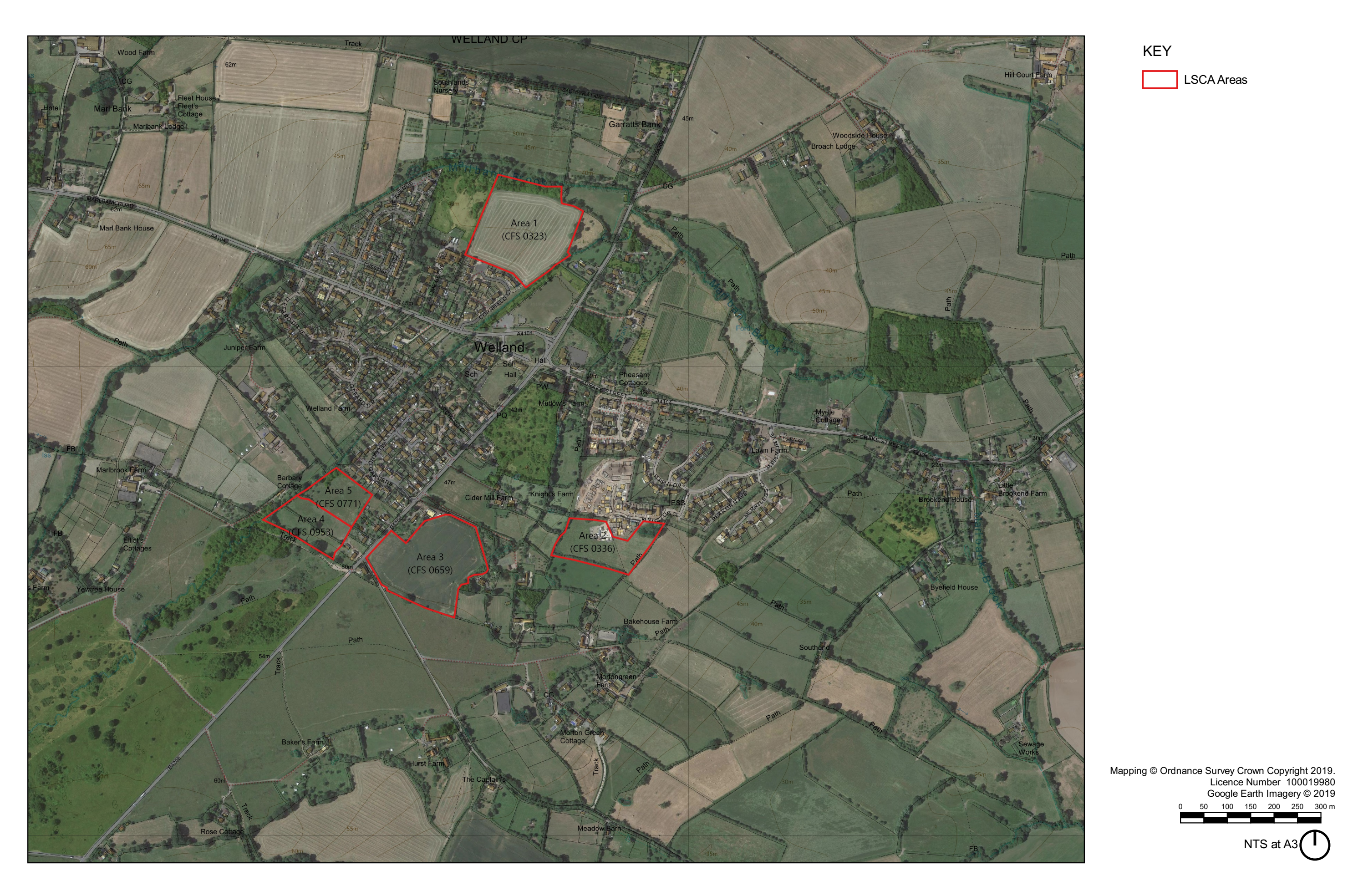
Figure 1 - 2019 LSCA Areas Location Plan