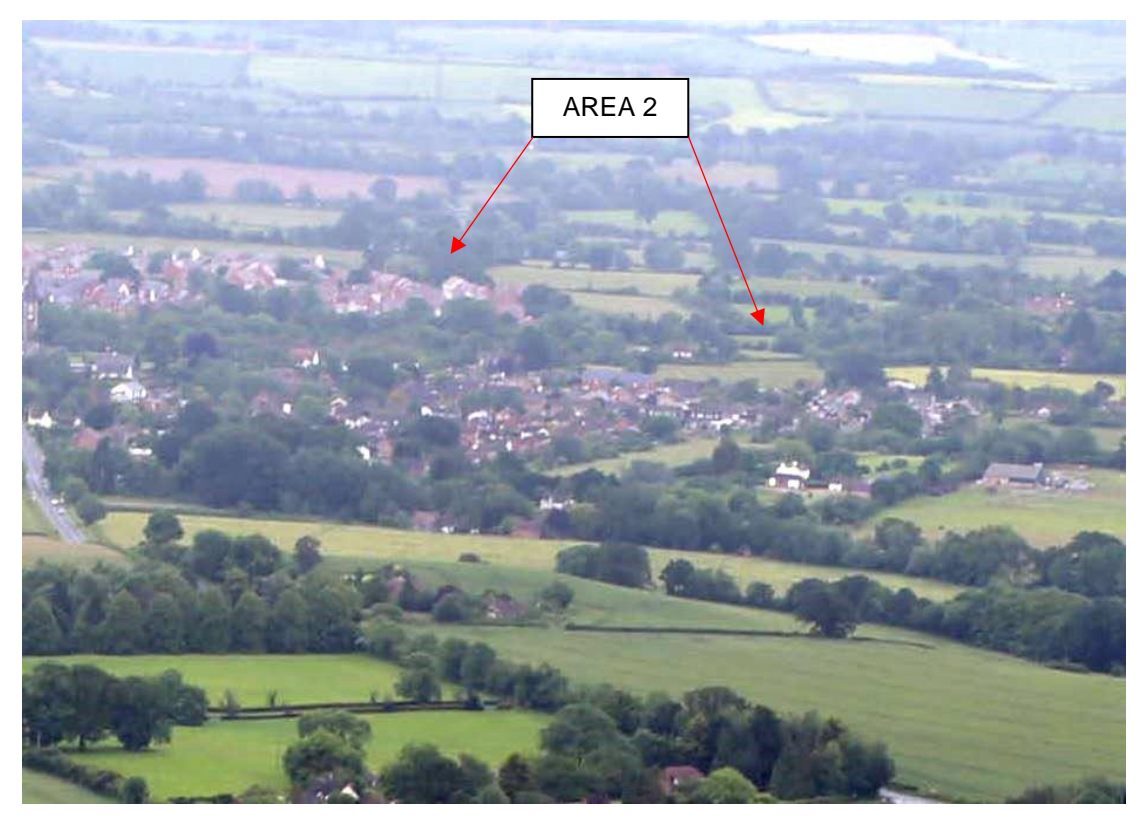
3.4.15 The Area is also visible from British Camp Iron Age hillfort and Scheduled Monument, a prominent and iconic skyline feature. The Area lies c. 3.8km from the summit, which is the location of 'Exceptional' AONB viewpoint no. 49. From this angle of view the degree of visibility