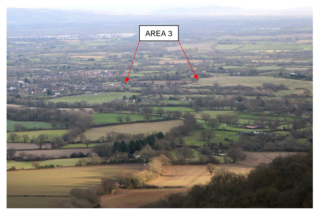
View looking east / north east from British Camp

Area also visible from Hills' ridges and summits to north west: villagescape 'intervenes' somewhat in views from these locations (as shown in photo from Black Hill below). View looking east from Black Hill