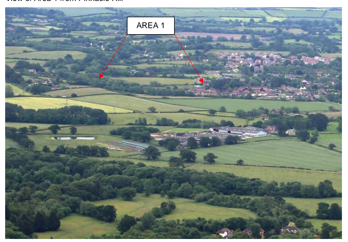
View of Area 1 from Black Hill